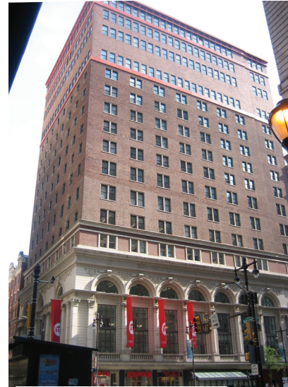
Ritz Carlton (Terra Building)

The west side of Broad Street was the site chosen for the clubhouse of the Philadelphia's Manufacturers' Club, an organization that embodied the city's industrial preeminence as the "Workshop of the World." Fittingly, they chose to build themselves a small, limestone-clad skyscraper at the dawn of the new century.