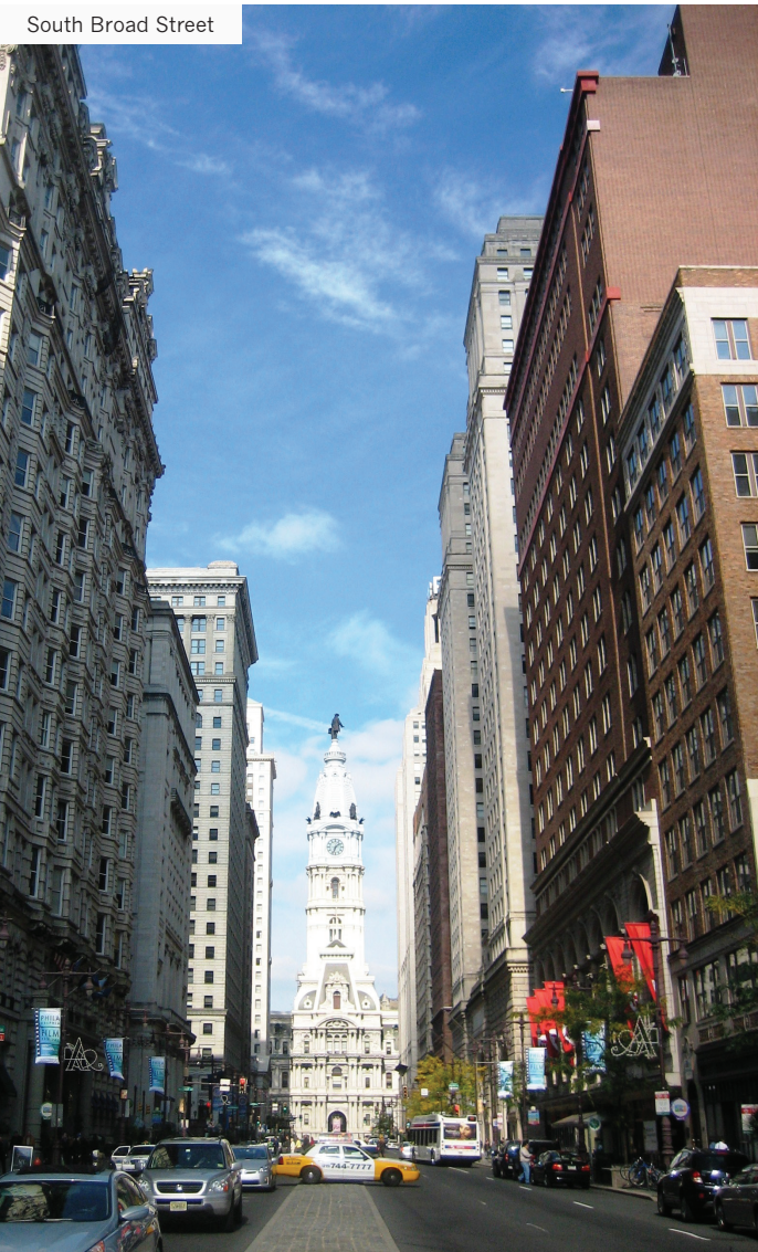
South Broad Street