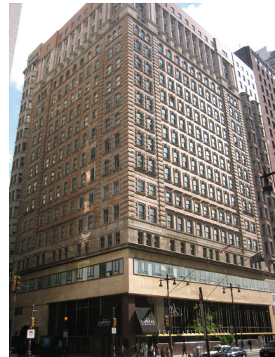
Real Estate Title and Trust (Avenue of the Arts)