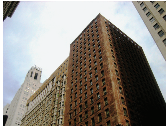
Real Estate Title and Trust, and North American

But all is not well at the rooftop level, and four of the most significant buildings in the first blocks of South Broad come up short, architecturally speaking. They have lost their crowning ornaments to the vicissitudes of age, taste, and economics, and they now stand like bareheaded bystanders at a fancy hats competition. The seriousness of this loss is highlighted by a comparison of the two towers of the Land Title and Trust Building (100-118 South Broad, 1897-98, 1902, Daniel Burnham architect), still proudly scribing the sky with their decisive entablatures, and the two bald buildings directly across the street, the Real Estate Title and Trust Building (now called the Avenue of the Arts Building, 101 South Broad, 1897-98) and the North American Building (121 South Broad, 1900).