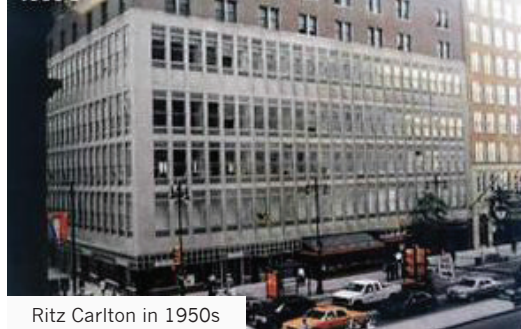
Ritz Carlton in 1950s